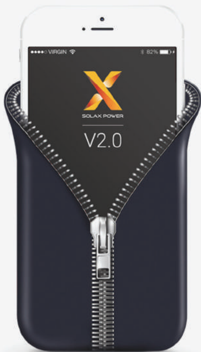
*SolaX Portal V2 - Releasing Soon